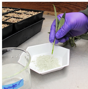
Figure 4. Propagation using talc powder-based formulations (clockwise from top left): measure powder into a sterile container; premoisten the cutting; coat the base of the cutting in the powder; dig a hole in the media and insert the cutting.