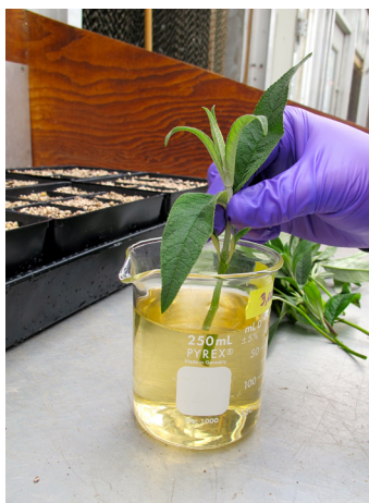
Figure 2. Dip the basal portion of the vegetative cutting into auxin solution for a few seconds.

Disadvantages: More time and space required for treating cuttings; solution uptake will vary with environmental conditions (Blythe et al., 2007).