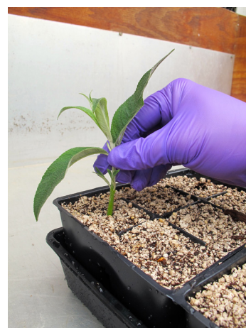
Figure 3. Inserting the treated cutting into growing media.