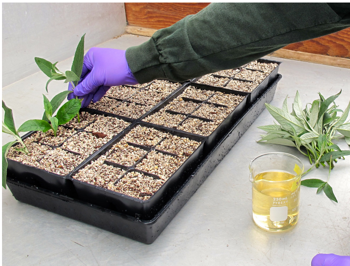
Figure 1. Root-promoting compounds are recommended for the commercial cutting propagation of many plant species.

Naturally occurring and synthetic plant growth regulators (auxins) are used by commercial nursery growers to initiate root formation on vegetative cuttings (Figure 1). Auxins increase rooting percentage and roots per cutting, encourage root development and uniformity, and stimulate rooting of difficult-to-root species. Commonly used auxins include indole-3-acetic acid (IAA), indole-3-butyric acid (IBA), and 1-naphthaleneacetic acid (NAA). Over the years, growers have used the potassium (K) salt of IBA (K-IBA) to prepare water-based IBA solutions. Technical grade K-IBA is not registered for this use, but other IBA formulations are available, including water-soluble salts, diluted concentrates, powders, and gels (Table 1).